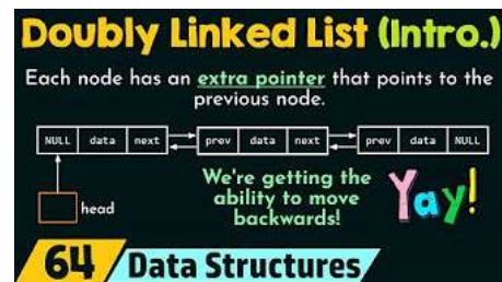
Doubly Linked List (Neso Academy)

https://youtube.com/playlist?list=PLBlnK6fEyqRi3-lvwLGzcaquOs5OBTCww&si=BOxOf3hFHITuOjSi