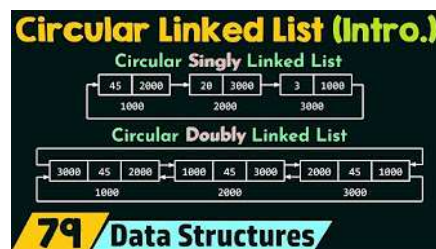
Circular Linked List (Neso Academy)

https://youtube.com/playlist?list=PLBlnK6fEyqRg7pacSDMgPn7vDVhz3N1uf&si=qc_kjTDpJvnQshzr